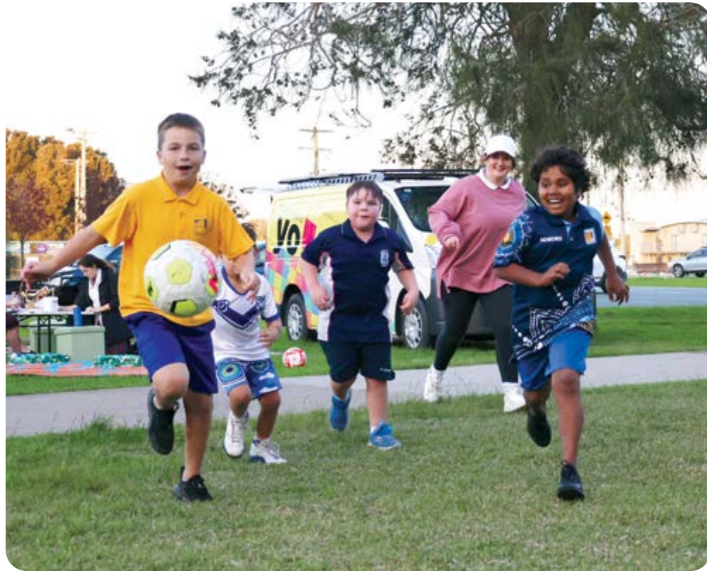
HANG OUT: Kids stop in for arts and crafts, football, board games, or to sit and chat.

What to do with 1.2 tonnes of oyster shells? Our Zero Hero volunteers were back at this year's Narooma Oyster Festival, diverting oyster shells from landfill. 63,000 oysters were devoured over a weekend and the shells saved will get a second life on artificial reefs or crafted into homewares. Some will end up in gin and even an oyster stout!